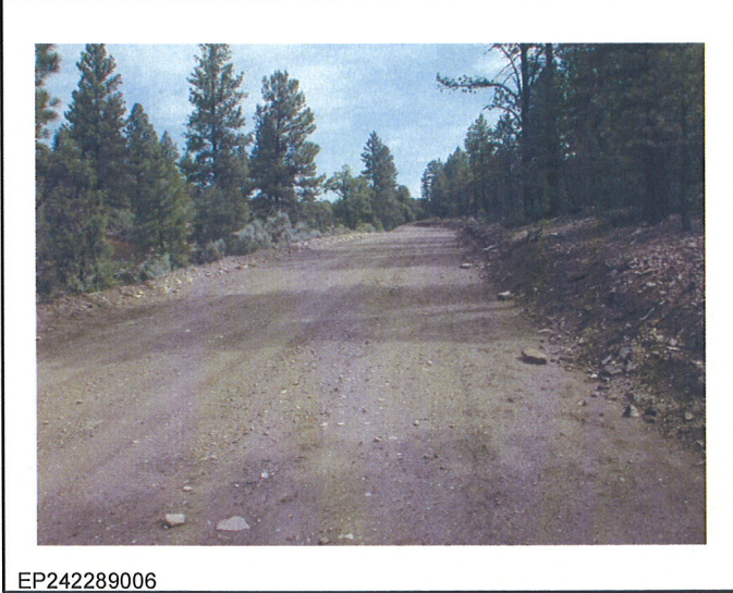
Pine Springs Road - Uintah County

SGID RD_ID RD242289 Map prepared by the State of Utah Automated Geographic Reference Center Room 5130 State Office Building Salt Lake City, Utah $4114 November 7, 2006